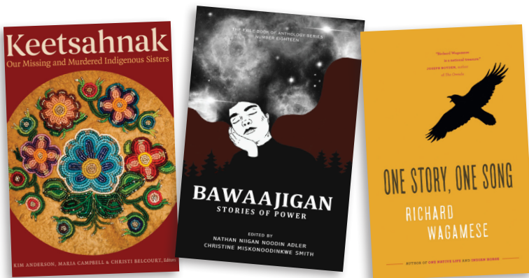
A glance at must-read titles from our annual 'Read Indigenous' campaign