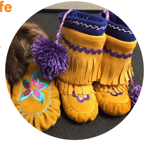
A moccasin workshop hosted by one of TPL's first Elders in Residence.