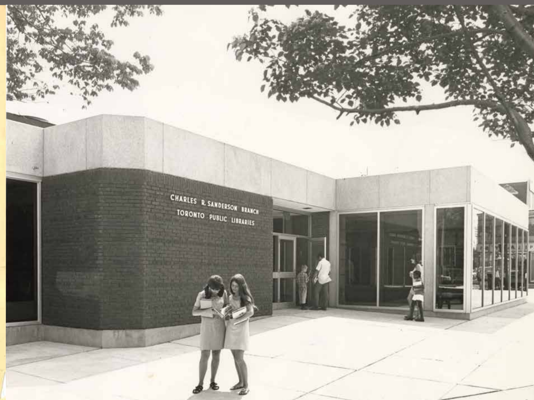
Exterior view, 1968