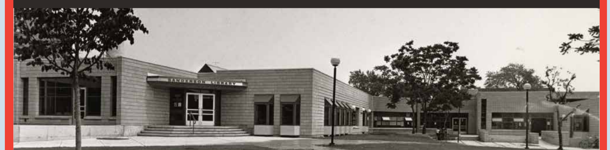
Expanded and renovated branch, part of the Scadding Court Community Centre, 1979

In 1977, construction began for a 3,800 square foot expansion as a part of the Scadding Court Community Centre project. The two-million-dollar project was a joint initiative between the Toronto Board of Education, the City's Department of Parks and Recreation and the Toronto Public Library Board.