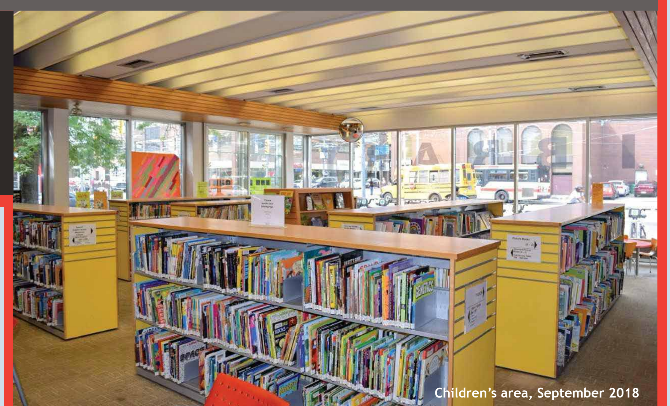
Children's area, September 2018