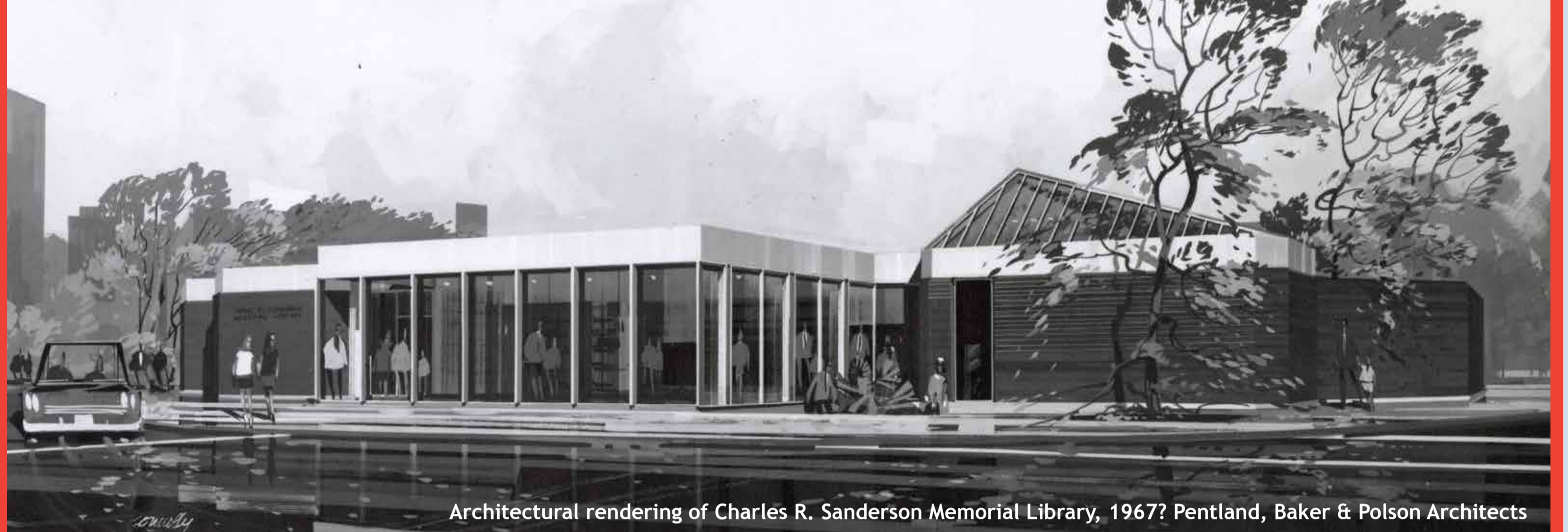
Architectural rendering of Charles R. Sanderson Memorial Library, 1967; Pentland, Baker & Polson Architects

The new branch was designed to house collections for children and young people, with the potential for a future second floor expansion for adult services, should the Central Library (then at College and St. George) be relocated in the future. It was built on land made available through the downtown urban renewal project at Alexandra Park.