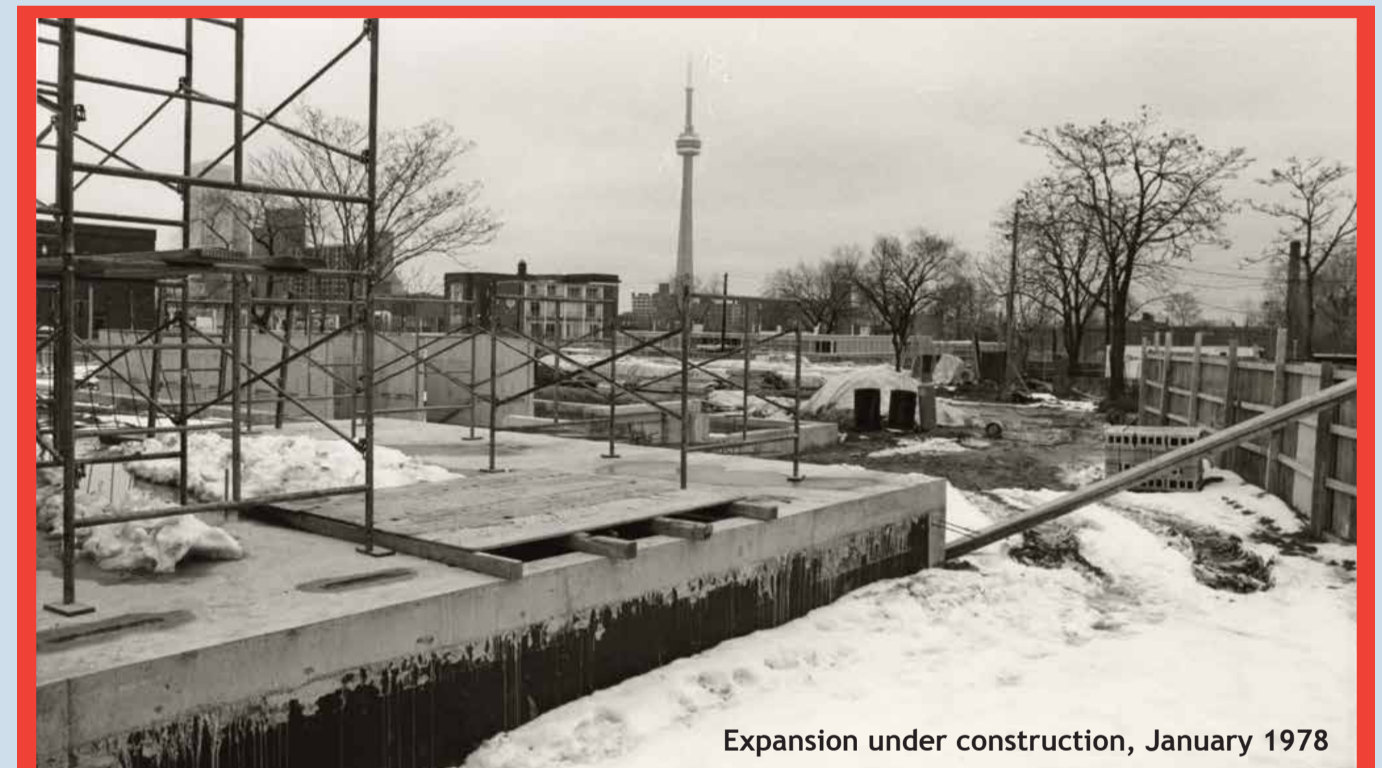
Expansion under construction, January 1978

When it opened, Sanderson Branch had a collection of over 19,000 volumes, and included such features as a fireplace and one of Toronto Public Library's first colour televisions.