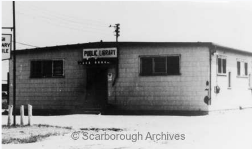
Golden Mile Branch, 1955